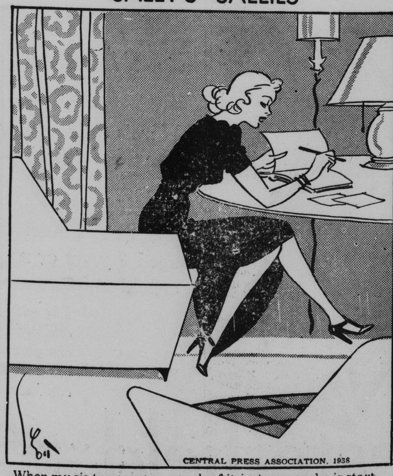
When my sis turns over a new leaf it just means she is starting another page in her diary.

as many things as possible during developing the right school spirit, to eral Department of Agriculture.