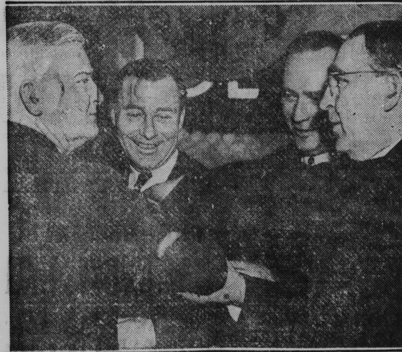
In all likelihood, the idea that Vice President John N. Garner is trying to put across, as Speaker William B. Bankhead feels the vice-presidential muscle, is that he got that way from eating oranges. Vice President and speaker joined in urging the public to recognize and take part in national orange week. The picture was taken in the capitol.