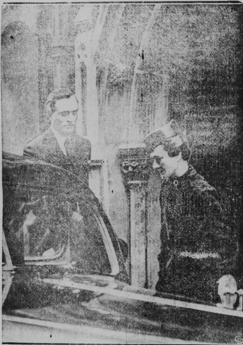
Duchess of Windsor entering car in Paris

Word comes from France that the Duke and Duchess of Windsor are "happier than at any time since their marriage" last June. While the duchess arranges the Chateau de la Maye, near Versailles, to suit her taste and plans large-scale entertaining, the duke passes most of his time playing golf. The duchess, seen about to enter her car in Paris, has a staff of 20 servants.