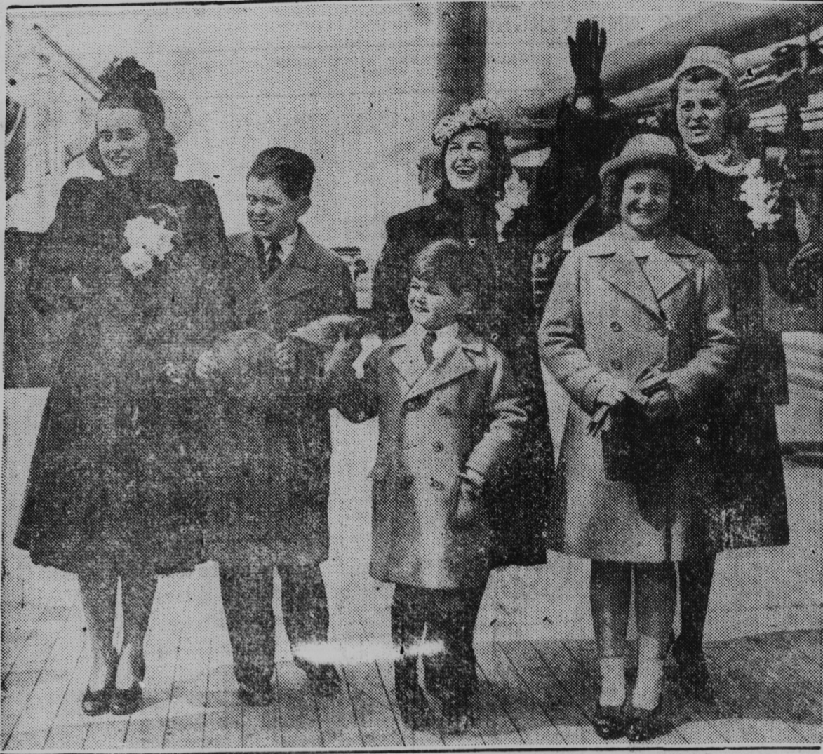
Mrs. Joseph P. Kennedy, wife of the new United States Ambassador to England, is shown with five of their nine children aboard the United States liner Washington just before they sailed from New York to join the ambassador in London. Left to right, they are: Kathleen, Robert, Teddy, Jean, Mrs. Kennedy and Patricia.