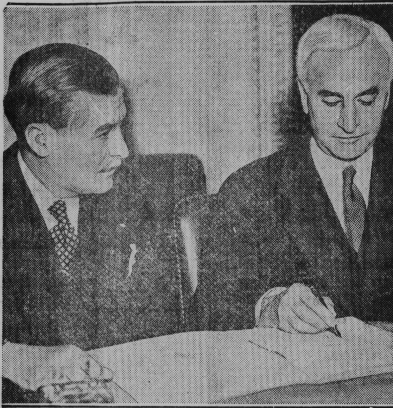
Vladimir Hurban (left), Czechoslovakian minister to the United States, is pictured with Secretary of State Hull in the State Department building at Washington, as Hull affixed his name to a new reciprocal trade treaty between the United States and Czechoslovakia.