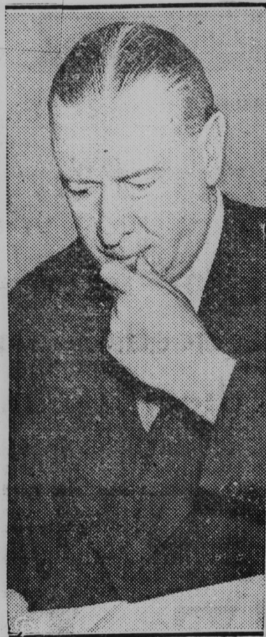
Richard Whitney ... in Wall Street failure

Unable to meet its obligations, the stock exchange firm of Richard Whitney & Co., New York, has been suspended by the New York Stock Exchange for insolvency. Whitney, senior partner, was president of the stock exchange from 1930 to 1934 and for years has been a dominant factor in the exchange's affairs. He is a brother of George Whitney, partner in the banking firm of J. P. Morgan & Co. Whitney was ordered by the stock exchange to stand trial on charges of violating the exchange's code of business ethics.