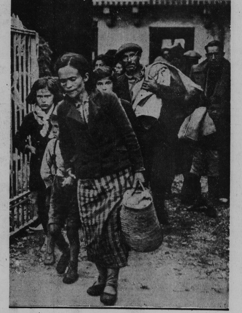
Thousands of refugees crossed the Franco-Spanish border at Luchon, France, as Franco's victorious rebels invaded new Loyalist territory. Militiamen who had crossed the border were returned to Spain, but sanctuary was given women and children, some of whom are shown, with their few remaining belongings, at the Luchon camp.

GOVERNMENT ARMY IS IN FULL FLIGHT TO MEDITERRANEAN