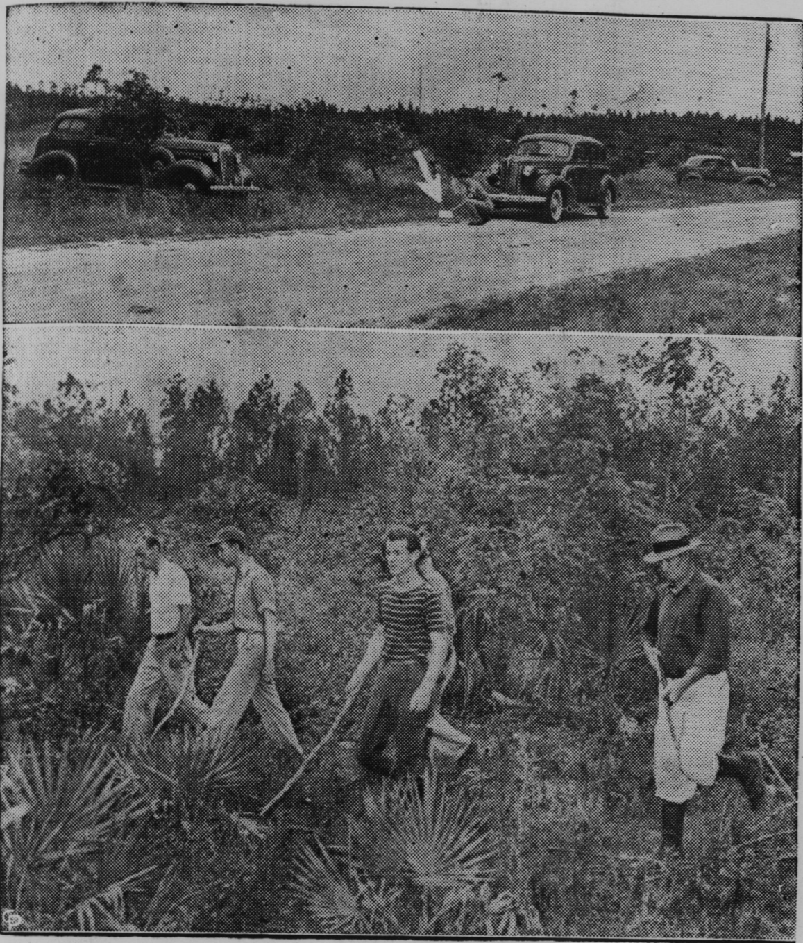
Top, arrow points to spot where ransom money was paid as scene was re-enacted for authorities; below searchers hunt everglades for missing boy

How Boy's Father Paid Over $10,000 Ransom