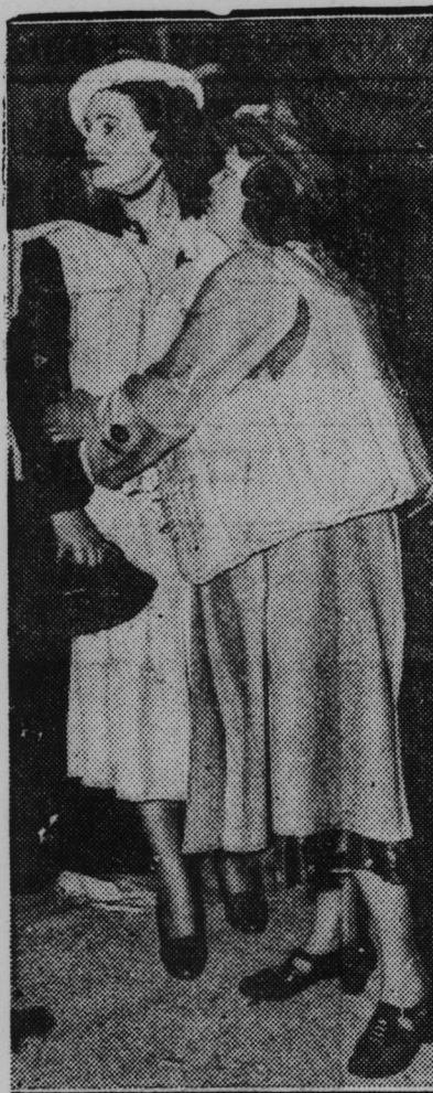
These two women are pictured aboard a Coast Guard cutter after they had been rescued from the sinking Mandalay, excursion steamer which foundered in New York Harbor after a fog-collision with the Bermuda-bound liner Acadia. Not a life was lost in the mishap.