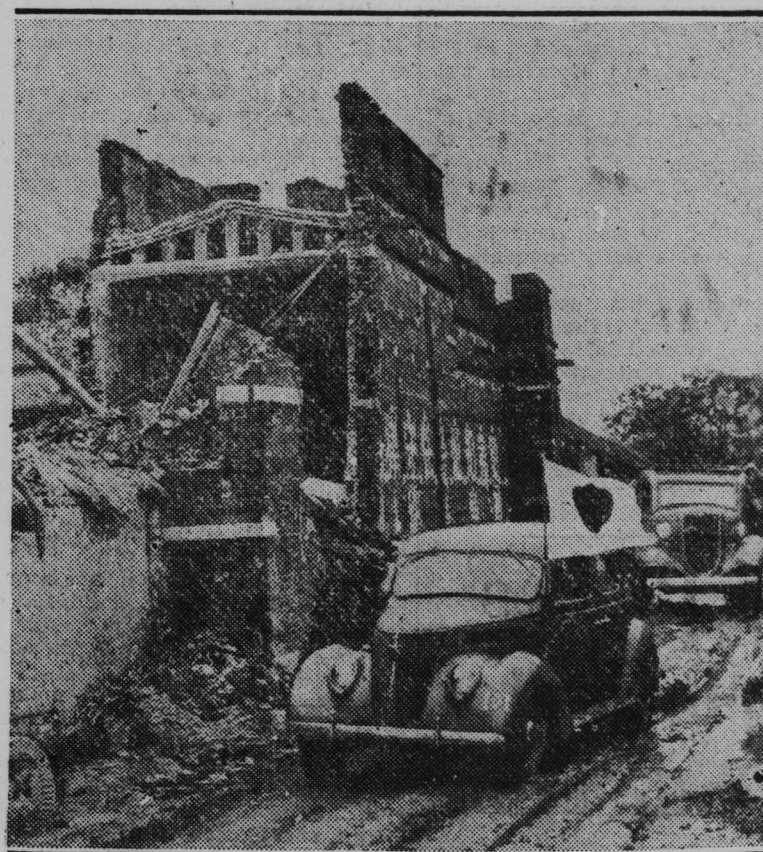
In the battle to capture strategic Soochow from the Chinese, the Japanese partially solved the transportation problem by the liberal use of American cars and trucks. Pictured above, two of the American-made machines pass a building blasted in the course of battle.