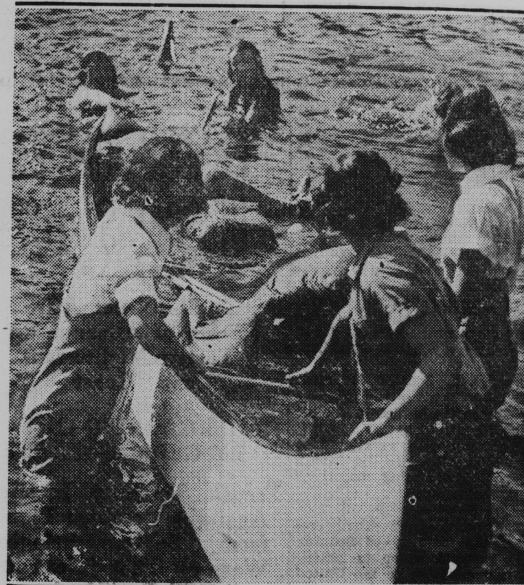
Headed for shore after winning the interclass races on the Charles River at Aburndale, Mass., Lasell College's junior row crew were hurled into the water when their war canoe capsized. Here are the girls, scrambling out of the drink. No one was injured.