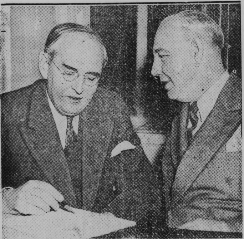
Pictured in discussion of the new relief bill are Senators Arthur H. Vandenberg (left), Michigan Republican, and Ernest Lundeen, of Minnesota. Senator Vandenberg's motion to increase the fund set aside for direct relief was defeated. Lundeen asked an additional three billions for pump priming.