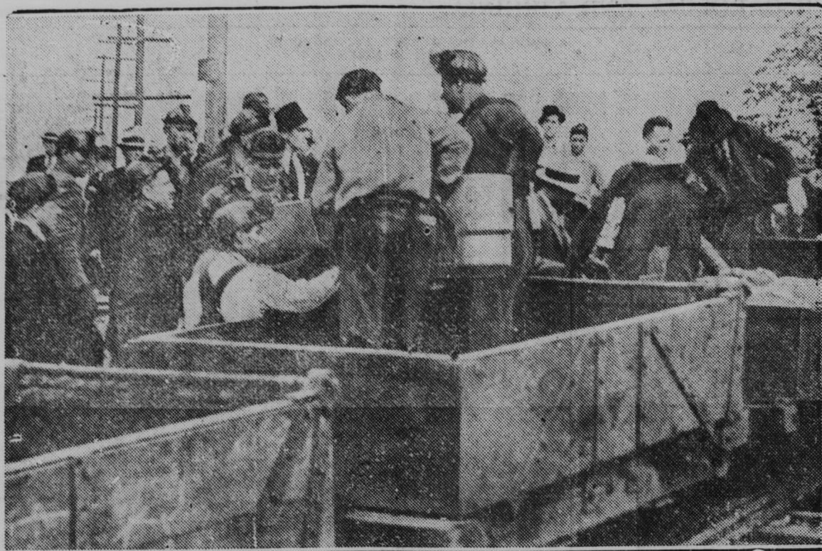
Bodies of the ten miners who lost their lives in the mysterious gas explosion in the Butler Colliery of the Volpe Coal Company at Pittston, Pa., are being removed in mine cars in the picture above. Besides the ten dead, five were seriously injured, two of the latter blinded by the terrific blast.