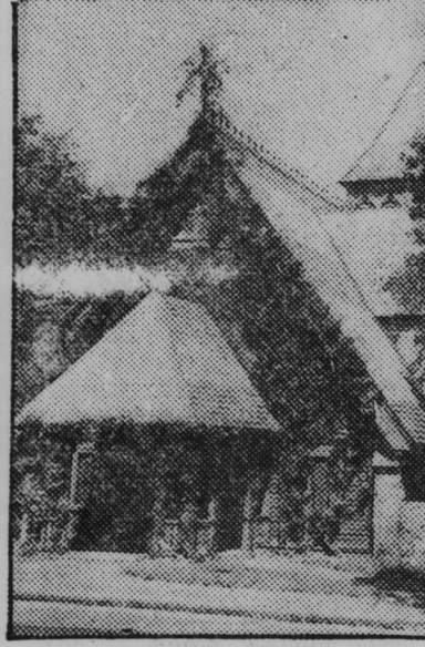
Nahant church, wedding scene.