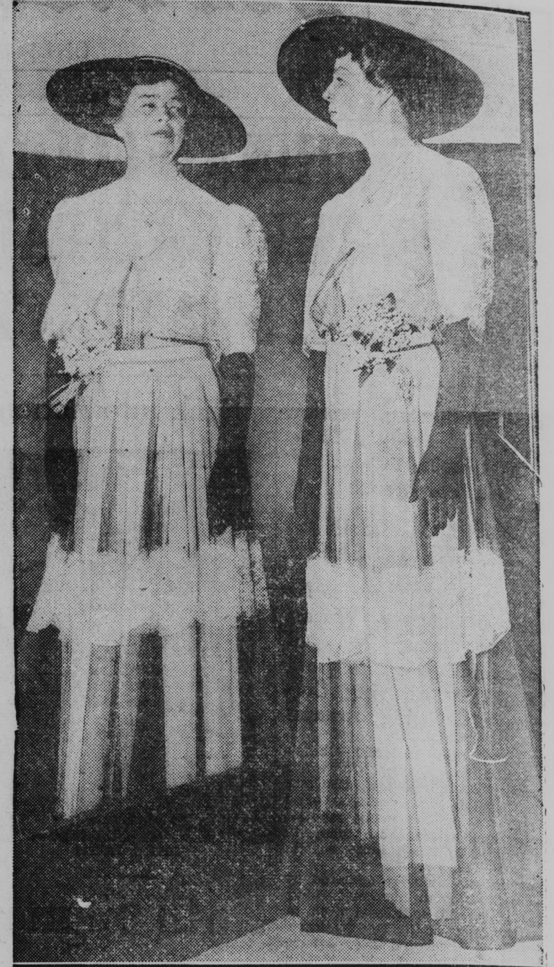
Mrs. Franklin D. Roosevelt, wife of the President, is shown at Arnold Constable's, New York, in the dress she had selected to wear at her son, John's, wedding. It is a picturesque period gown fashioned of navy blue net atop a soft blue crepe slip. Scalloped medallions of chantilly lace outline the neckline. Soft blue lilies of the valley fasten over the narrow blue belt. The picture hat is of hand-blocked navy net, banded with navy velvet and grosgrain. Soft navy shoes and long navy gloves complete the wedding ensemble.