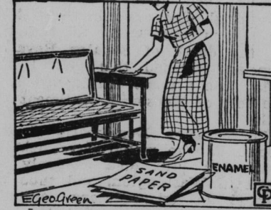
To remove rust from painted surfaces use sandpaper. Don't try to cover rust spots with new paint. They will show through.