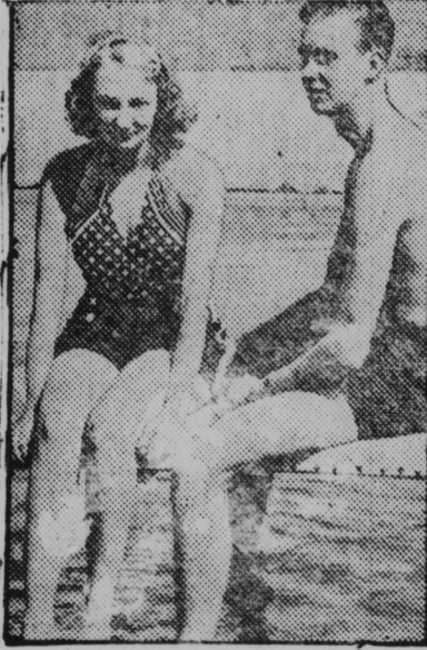
At their own new pool.