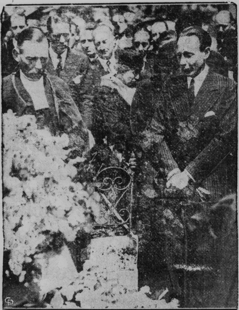
Jean Borotra ... one great tennis star pays tribute to another With head bowed and eyes filled with tears, Jean Borotra, famous French tennis player, stands amid friends and relatives of Susan Lenglen in final tribute to the woman who once was known as the world's greatest woman tennis player, during burial services at Paris.