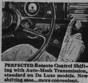
PERFECTED Remote Control Shifting with Auto-Mesh Transmission, standard on De Luxe models. New shifting ease...more convenient.