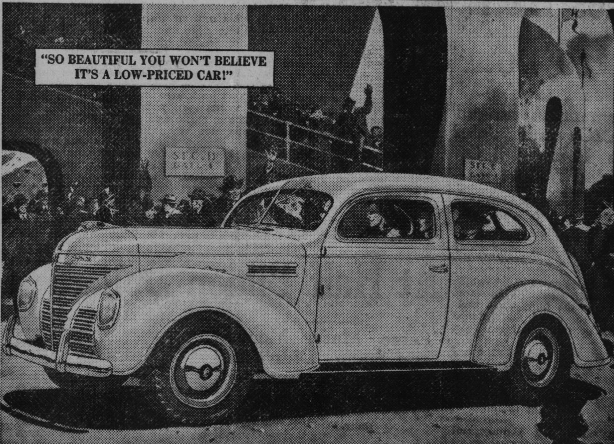
THE 1939 PLYMOUTH "ROADKING" Two-Door Touring Sedan...with 100% hydraulic brakes, completely rust-proofed all-steel body.