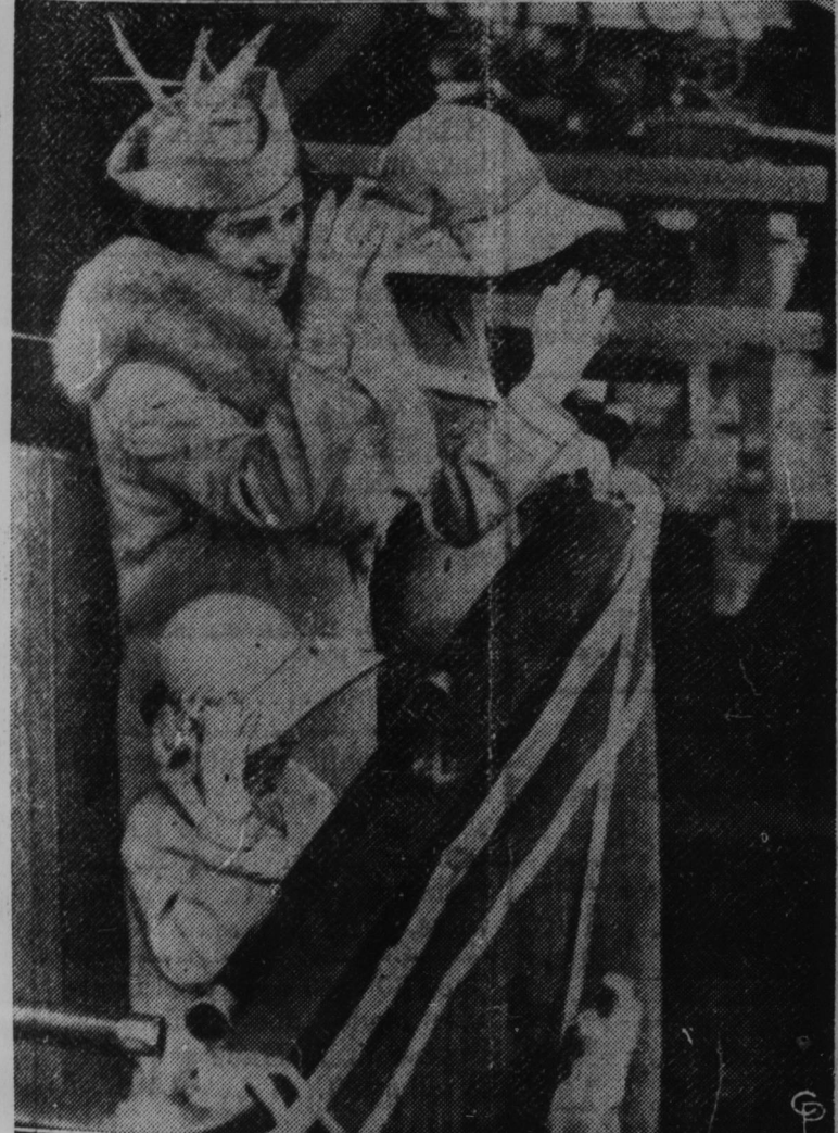
Her Majesty, Queen Elizabeth, of England, is pictured waving to the crowd that greeted her when she appeared on the dais at the Clydebank, Scotland shipyards, to officiate at the ceremonial launching of the Queen Elizabeth, Britain's new luxury liner named after her. With her Majesty are Princesses Margaret Rose (left) and Elizabeth.