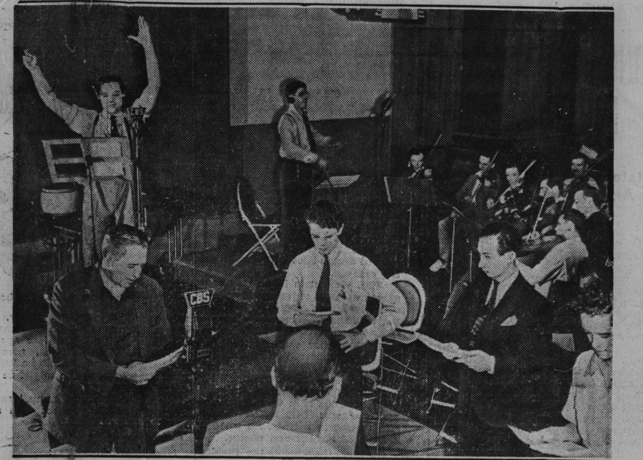
Orson Welles, youthful guiding light of the "Mercury Theatre of the Air," is pictured, arms upraised, with his company directing a rehearsal of one of his plays. The Federal Communications Commission has launched an inquiry into Welles' broadcast of a dramatization of H. G. Wells' novel, "The War of the Worlds." The broadcast created widespread panic among radio listeners throughout the country.