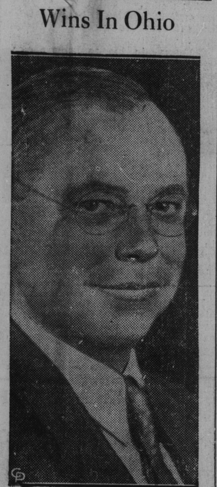
Wins In Ohio

Taft, Republican son of former President and Chief Justice William Howard Taft, defeated Senator Robert Bulkley, New Deal Democrat, in Ohio.