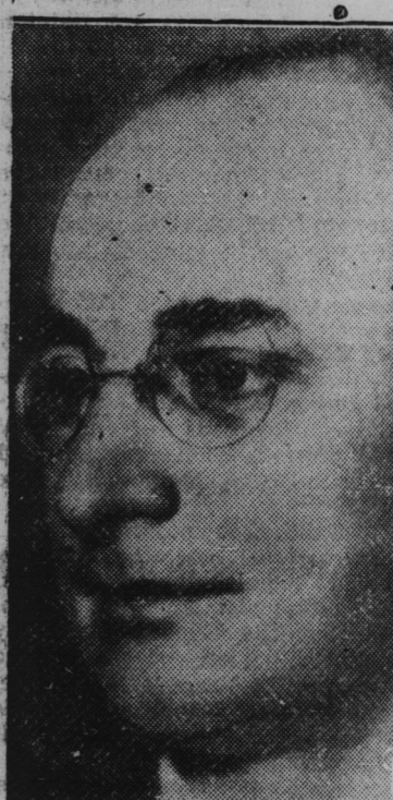
In the country where men rise to prominent positions quickly, and sometimes disappear just as quickly, Lavrenti Barea (above), former Georgian secret police chief, has emerged as third most powerful man in Russia. He has been appointed acting assistant to commissar for home affairs.