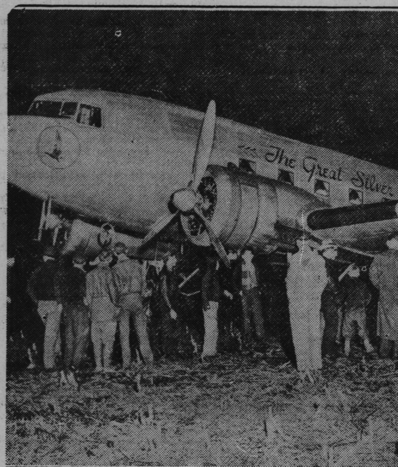
A few minutes before this picture was made, Pilot "Slim" Babbitt had brought this huge Eastern Airlines luxury ship to a safe landing in a cornfield near Baltimore, Md. The fog that forced the ship down swept in from the sea without warning. Not the slightest damage was done to the plane, which carried 21 passengers and a crew of three.