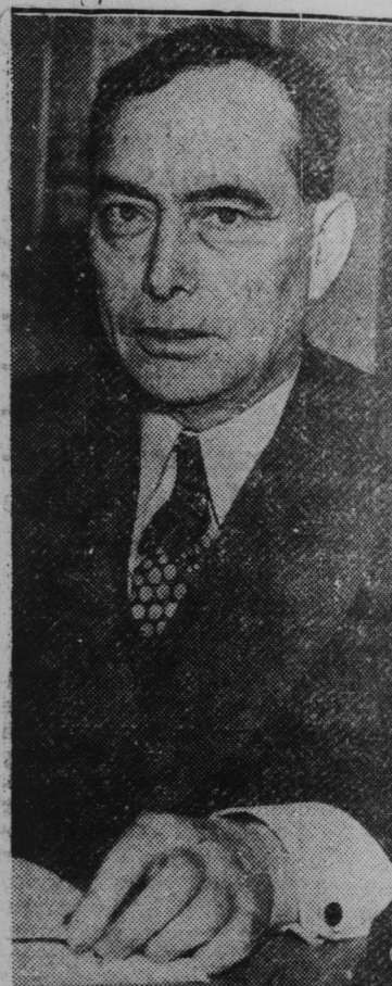
Representative Joseph William Martin, Jr., of Massachusetts, looked upon as next Republican floor leader, is pictured at his desk, in Washington, ready for opening session of Congress.