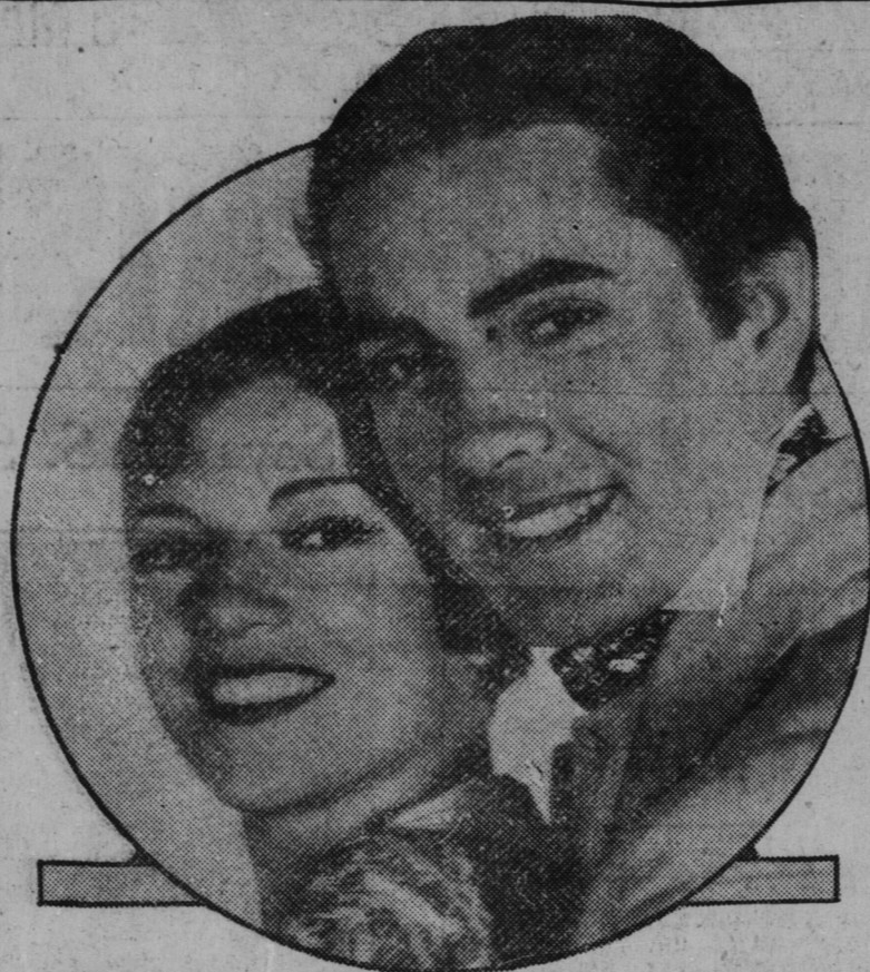
Tyrone Power and Annabella are shown above as they appeared in a recent picture. The glamorous French star was on hand to meet the handsome Hollywood leading man on his arrival at Rio de Janeiro after a 5,000-mile air tour, causing report they have changed their screen romance to a real one.