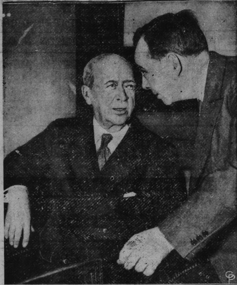
Representative Joseph P. Martin, of Massachusetts, standing, chats with former Senator Jesse P. Metcalf, of Rhode Island, at session of the Republican national committee meeting in Washington. Both are committee members. Martin may be chosen as Republican leader in the House of Representatives.