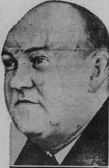
GASTON B. MEANS