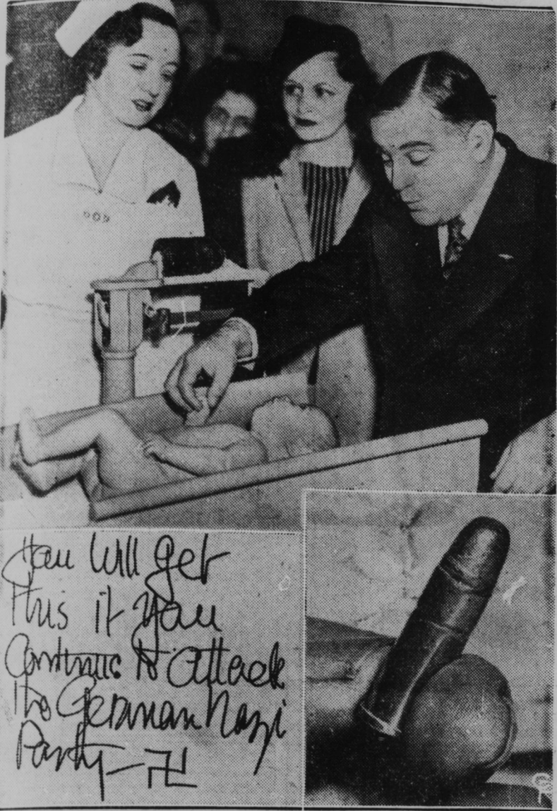
The same day Mayor Fiorello La Guardia, of New York, dedicated three health centers, he received a threatening letter, signed with a Nazi swastika, and with a bullet enclosed (as shown below). The Mayor is pictured weighing a baby at one of the centers. Note read: "You will get this if you continue to attack the German Nazi Party."