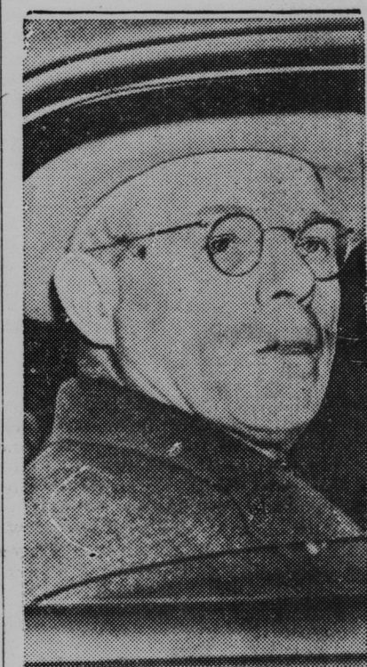
William E. Dodd, Sr., former United States Ambassador to Germany, is pictured at Ashland, Va., where he was arraigned on hit-and-run charges of having run down a little colored girl while driving near Hanover Court House, Va. Trial was set for Jan. 10.

Charged With Refusing Membership To Doctors Giving Service to Health Groups; Medical Association To Fight To Last Ditch, Fishbein Says