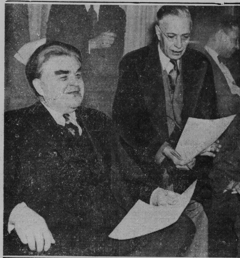
John L. Lewis, leader of the C. I. O., is shown at Washington as he held a press conference. He announced that the C. I. O. will stick to the Democrats and steer clear of third parties in 1940 "unless the Democrats pick a candidate opposed to labor's aims."