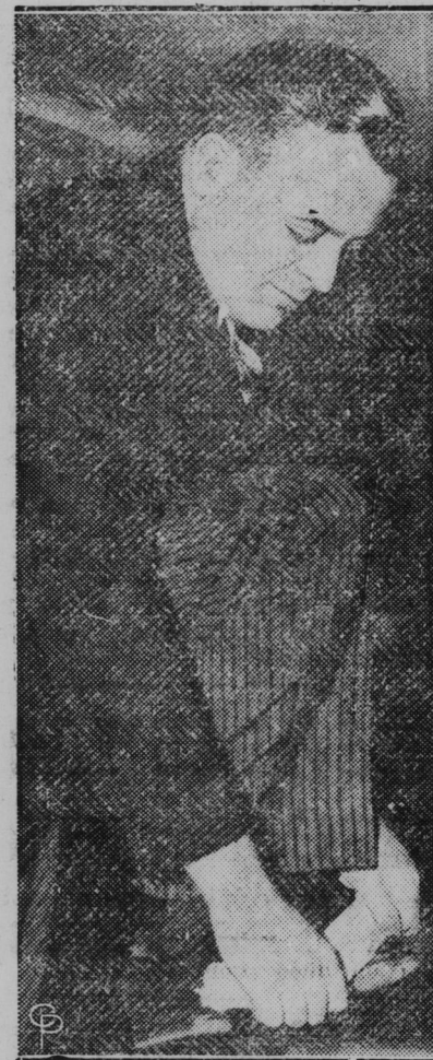
Senator H. Styles Bridges of New Hampshire gives his shoes a last-minute shine before entering the senate chamber. He was on way to hear President Roosevelt deliver message to joint session of the House and Senate.