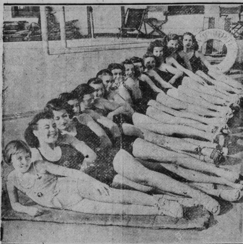
The Posse School swimming team, of Kendall Green, Mass., relaxes aboard the Amphitrite after a training session at Fort Lauderdale, Fla., in preparation for the indoor season. Undefeated last season and ranked as one of the leading school teams of the country, the girls hope to repeat in 1939.