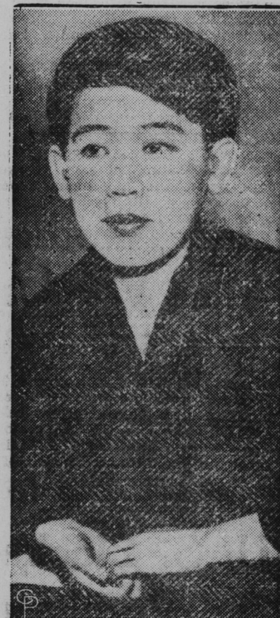
Yoshimiko Kawashima, known as the "Mata Hari of Japan," who was reported shot and killed at Tientsin, China. According to officials, she directed activities of a Japanese spy ring in Hong Kong, and was supposed to have been in Tientsin in connection with the new projected Central Government of China.