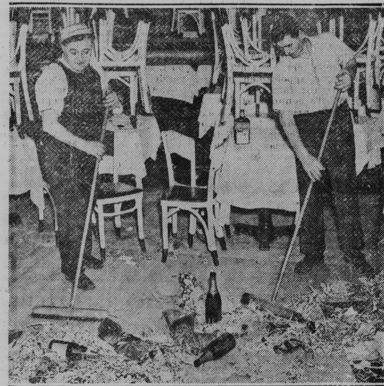
The debris of part of New York City's $15,000,000 New Year celebration is being swept up in one of the Rialto's gay spots after the last of the whoopee makers had gone home. New York's greeting to 1939 was the noisiest and most expensive in years.