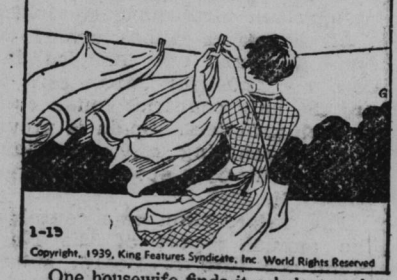
One housewife finds it a help to take her bath towels off the clothes line before they are quite dry. She then folds them and runs them through the electric wringer, instead of ironing them. Thus they retain their fresh, outdoor smell.