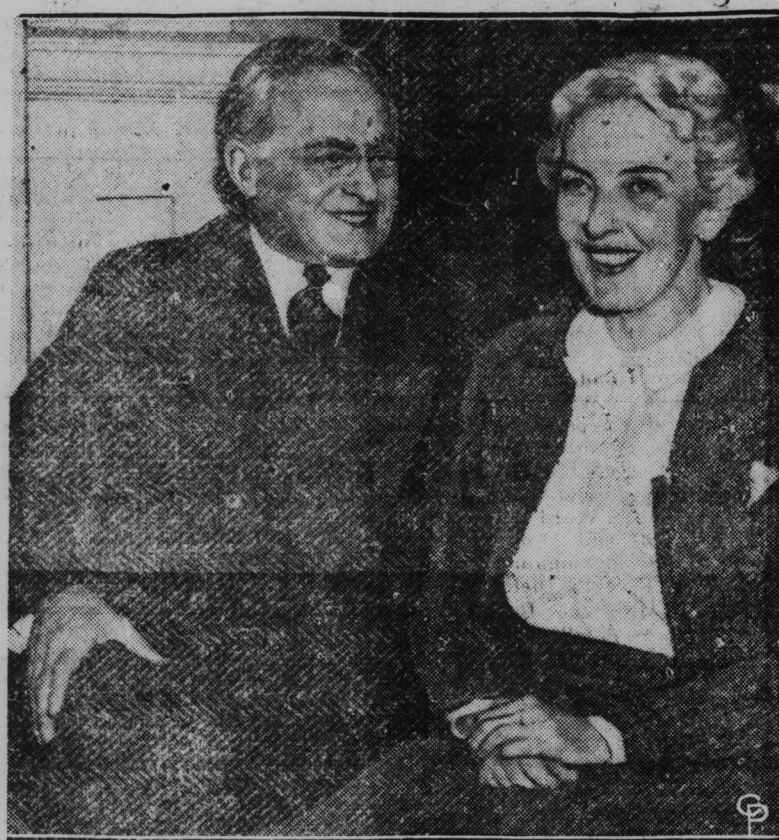
Felix Frankfurter, noted liberal and constitutional authority, named to Supreme Court bench, and his wife at their Cambridge, Mass., home, shortly after he received news of his appointment to the high court. He succeeds Associate Justice Cardozo.