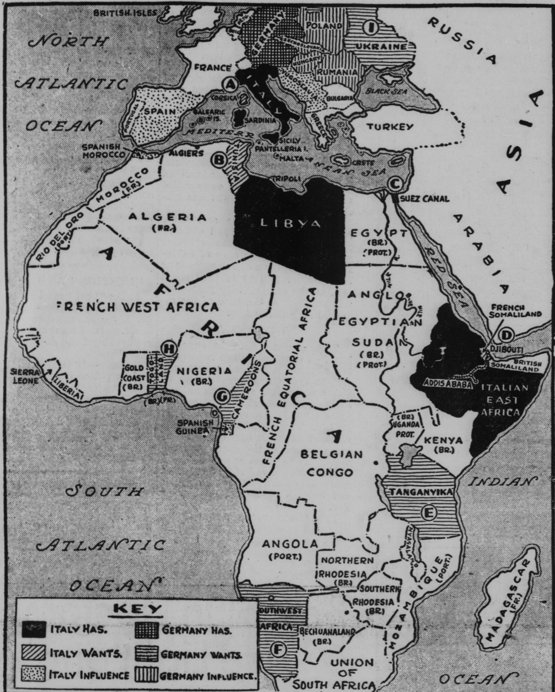
Desires of the Berlin-Rome Axis are outlined on this map. Key shows what each has, what each wants, and where each already dominates.