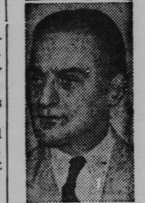
Gerald P. Nye

Mostly cloudy, rain tonight and probably in east Saturday morning; somewhat colder Saturday and in south central portion tonight.