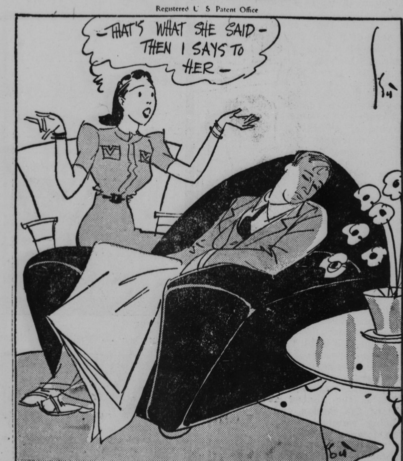
A woman may be outspoken, but very rarely out-talked.