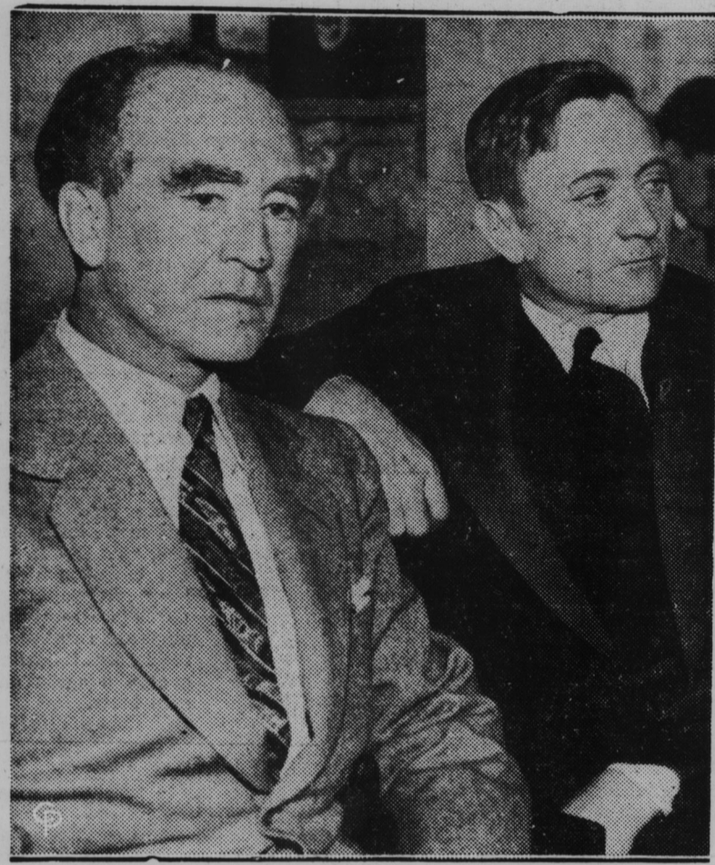
William O. Douglas (right) is pictured with Attorney General Frank Murphy at hearing of senate judiciary subcommittee in Washington, at which nomination of the SEC chairman to Supreme Court bench was approved.