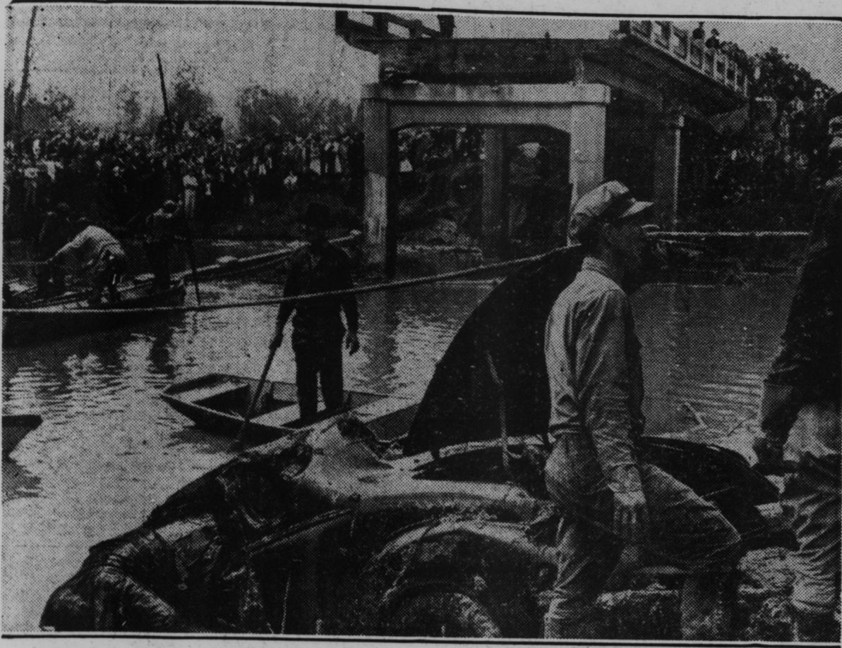
Here is the scene of tragedy eleven miles east of Vicksburg, Miss., after six automobiles, unwarned of the washed-out bridge (background) had plunged into the raging torrent. Seven bodies were recovered, with others believed washed downstream. One of the victims can be seen in car.