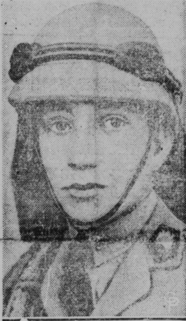
Death of King Ghazi, 27 (above), in Baghdad, who crashed in one of his high-speed automobiles, elevates to the throne of Iraq, land which is supposed to have included the Garden of Eden.