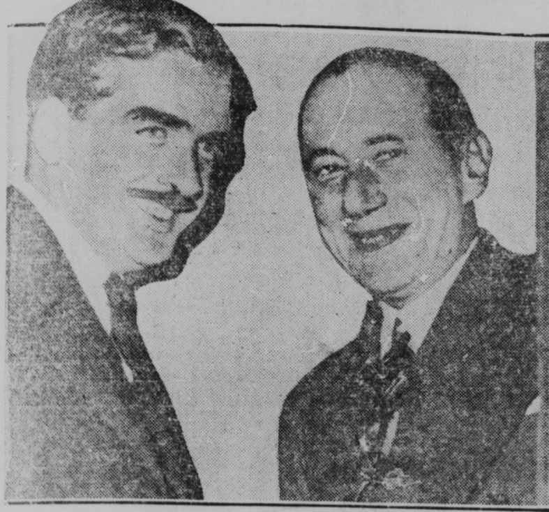
Anthony Eden (left), when British foreign minister, attempted to unite the democracies against the dictatorships...