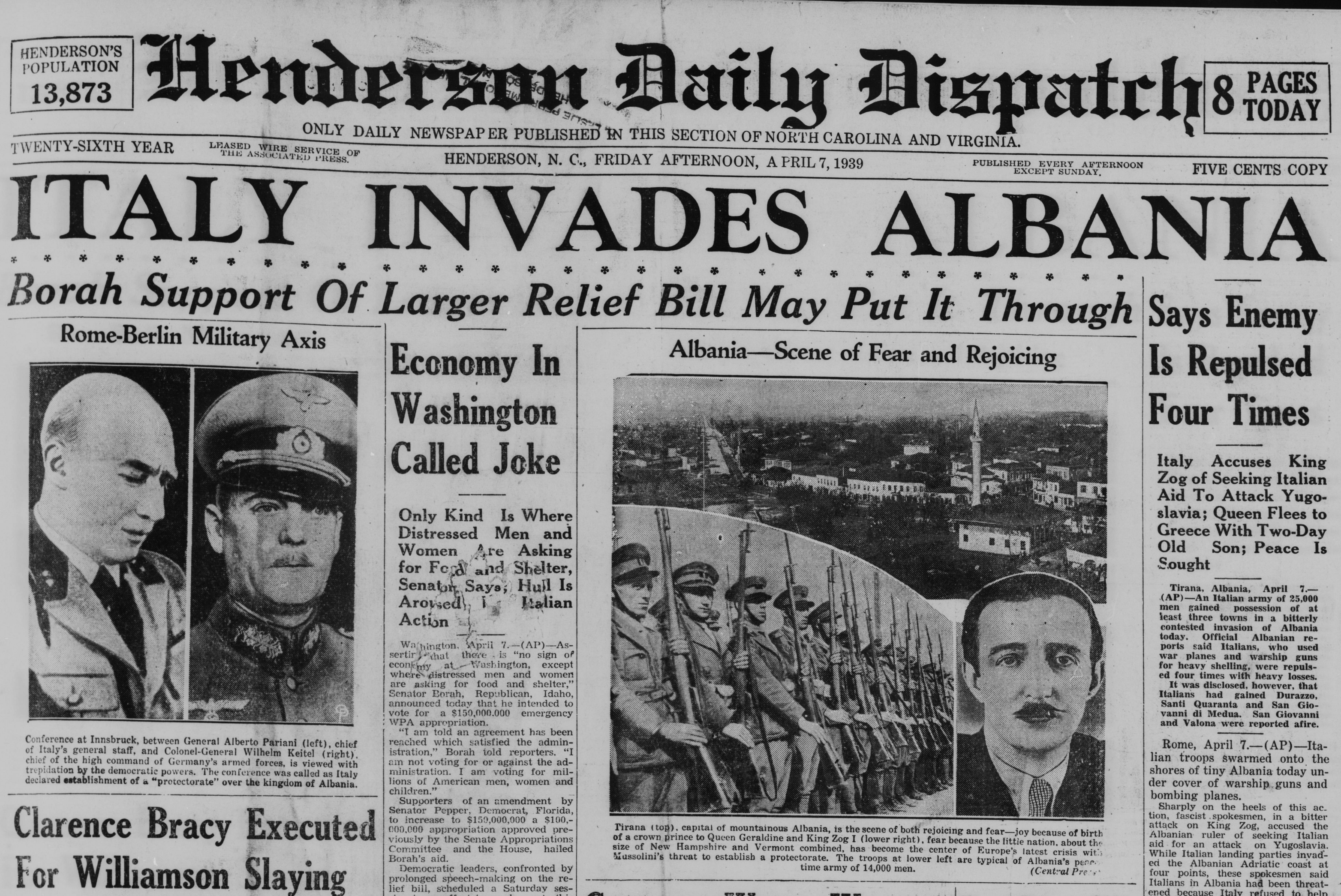
time army of 14,000 men.