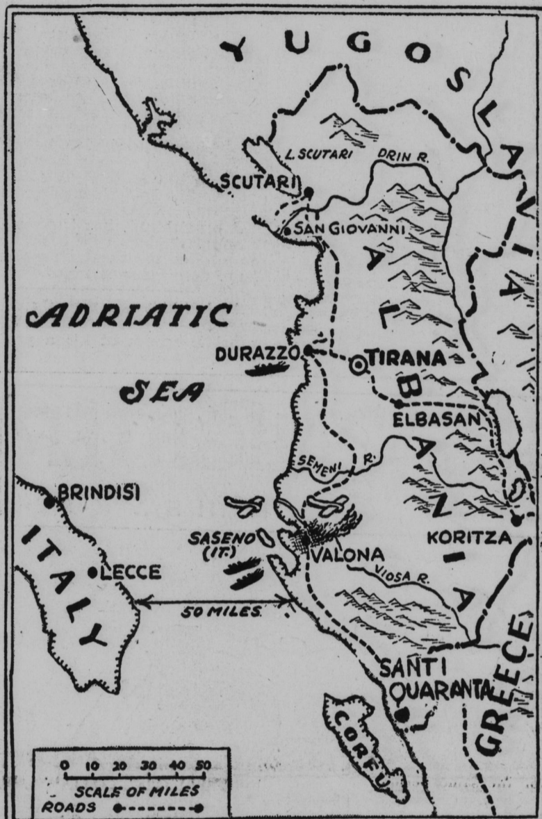
Map shows theatre of operations in the Italian invasion of Albania. Troops landed at San Giovanni, Durazzo, Valona, and Santi Quaranta, to blast their way into the interior, making Tirana, the capital, their first objective.