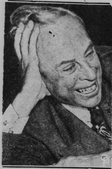
Alfred P. Sloan, Jr.

This informal picture of Alfred P. Sloan, Jr., was taken as the Detroit motor magnate testified in Washington before the Senate Monopoly Committee. The chairman of General Motors expressed his views on putting idle money to work declared, "We can never have confidence in the economy if the budget is unbalanced."