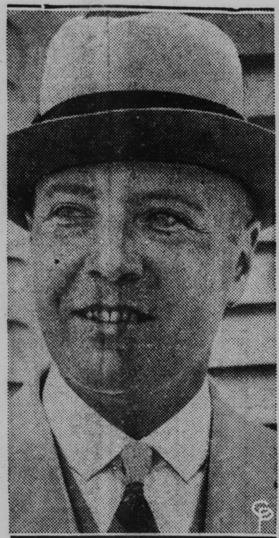
William C. Bullitt, United States ambassador to France, is pictured as he arrived in New York for a brief summer vacation. He is expected to make a report on the European situation to President Roosevelt and the State Department in Washington.