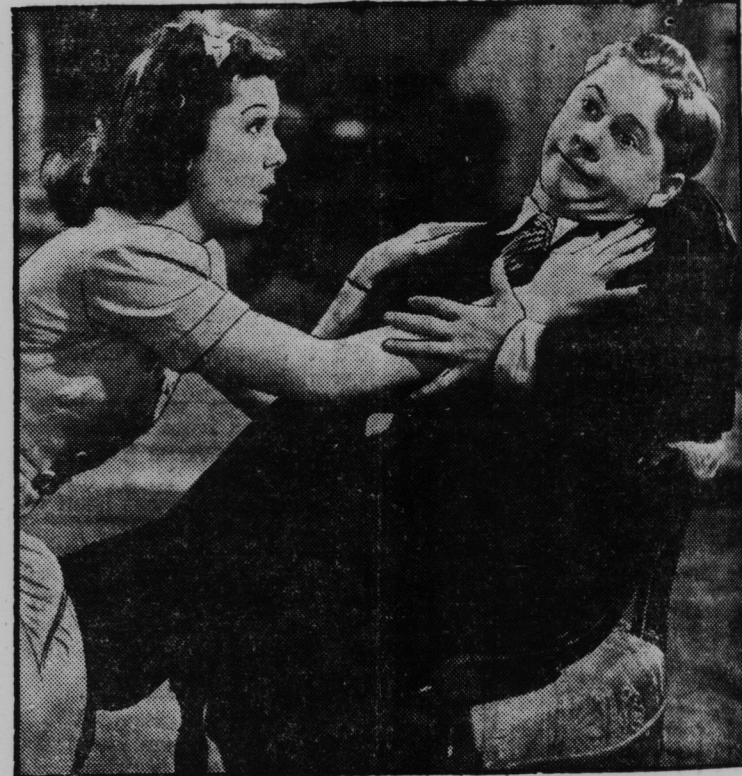
Mickey Rooney and Cecilia Parker in "The Hardy's Ridge High" Stevenson Monday and Tuesday.