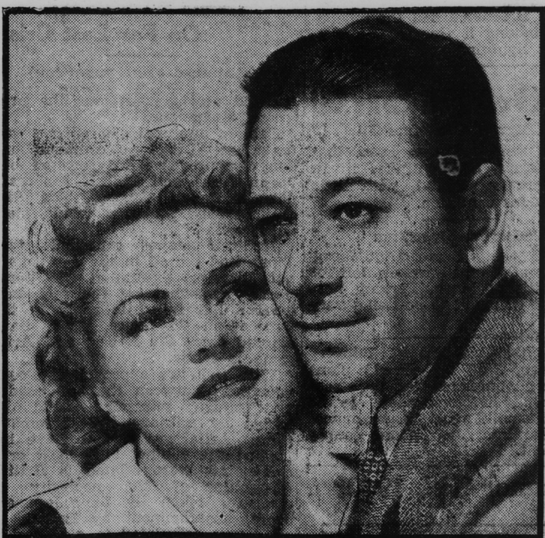
George Raft and Claire Trevor in "I Stole A Million" Stevenson Thursday and Friday.

"We Always Show Our Pictures At Their Best"