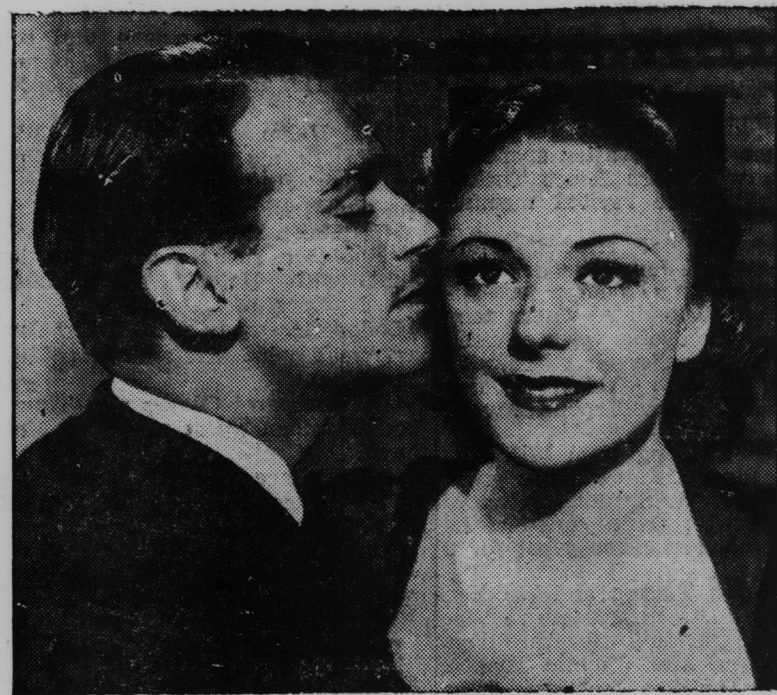
Douglas Fairbanks, Jr., and Virginia Fields in "The Sun Never Sets" Stevenson Wednesday only.