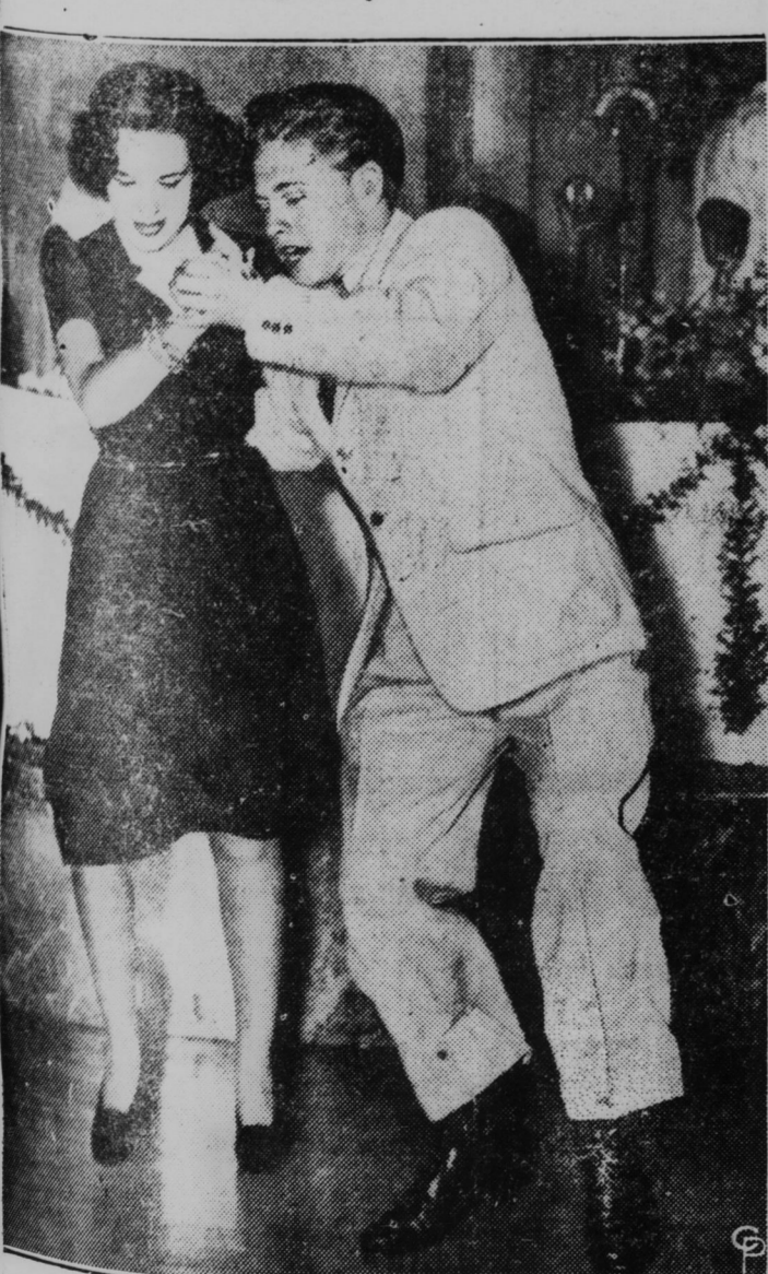
Forgetting their dignity, Mickey Rooney and Judy Garland, film stars, later and live with the best of them in jam session at New York's Waldorf-Astoria Hotel. They were hosts at luncheon for 150 school children selected from among 200,000.