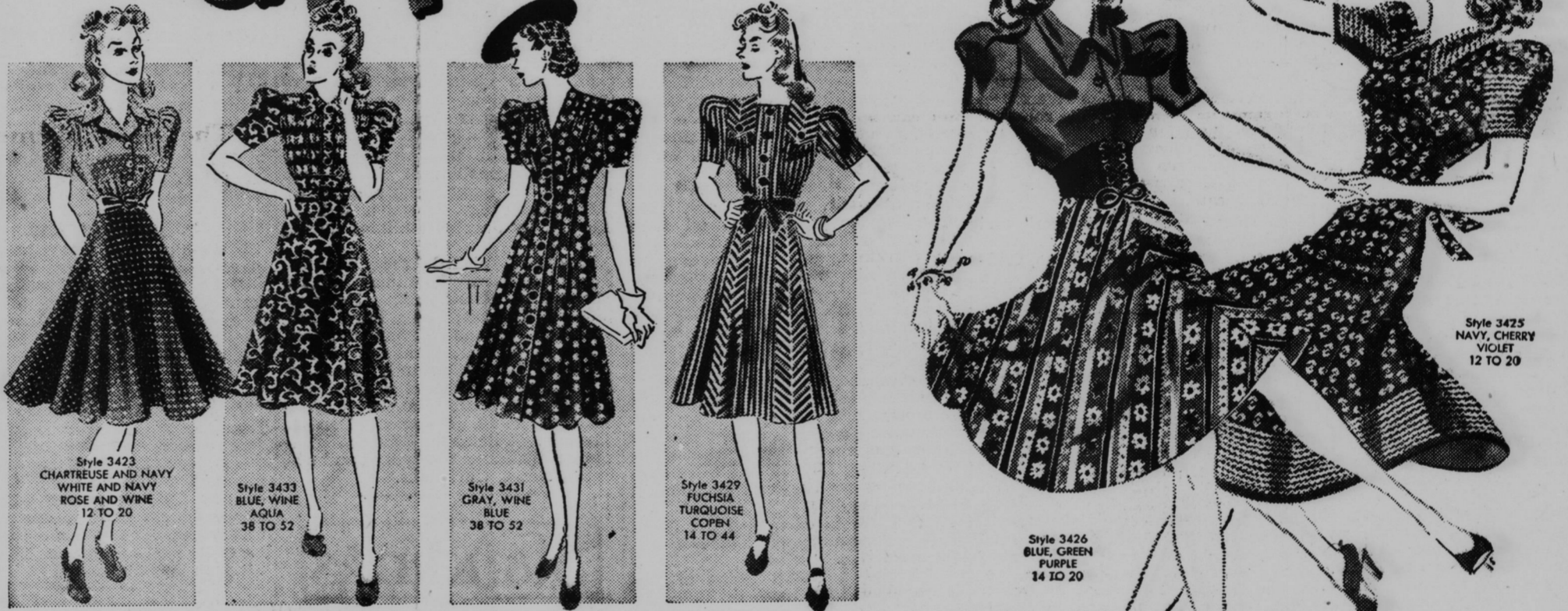
Style 3423 CHARBRISE AND NAVY WHITE AND NAVY ROSE AND WINE 12 TO 20