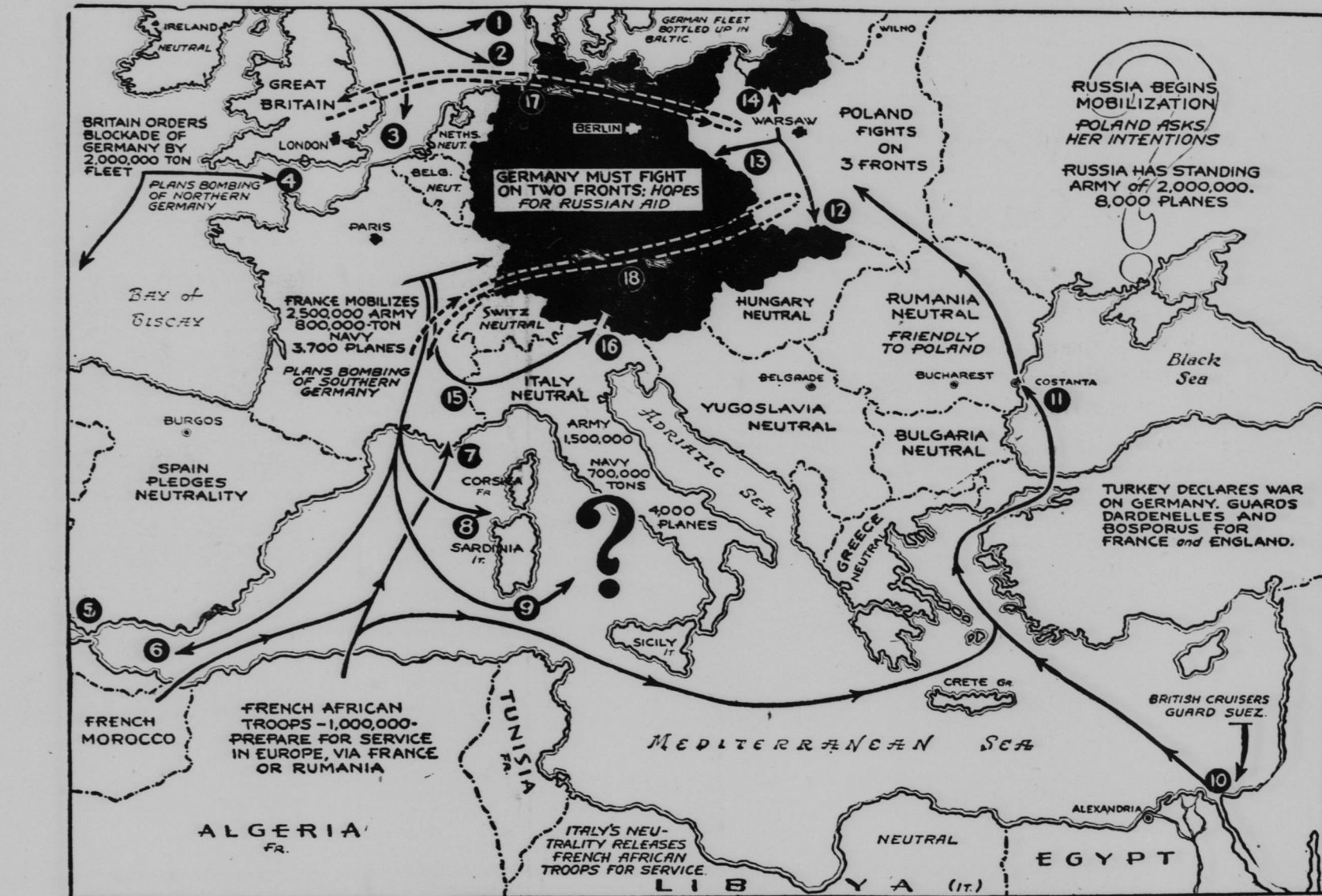
Russia has been "reported mobilizing." Italy has announced she will take "no military measures." Five big moves against Germany came with orders to Britain's fleet.