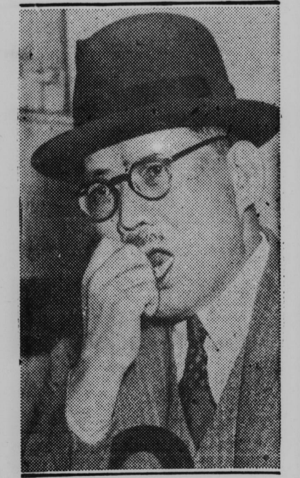
Toshio Shiratori, Japanese ambassador to Italy, is pictured on his arrival in New York on the Italian liner Conte di Savoia. More than 2,000 passengers, most of them Americans hurrying home from the war zone, were aboard the ship. The Nazi-Russ pact has placed Japan in an extraordinary position as regards power politics.