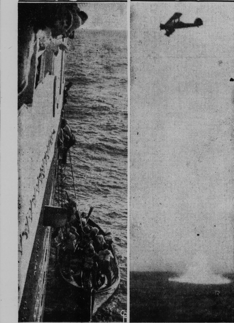
Survivors of the British freighter Kafiristan, torpedoed by a German submarine, clamber aboard the American Farmer (left), off the Irish coast. Just as the United States ship reached the scene, an Allied plane darted up and machine-gunned the sub, then bombed and sank it. Photo (right), made from the American Farmer, shows scene as the U-boat exploded after a direct hit.