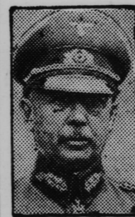
Gen. von Fritsch