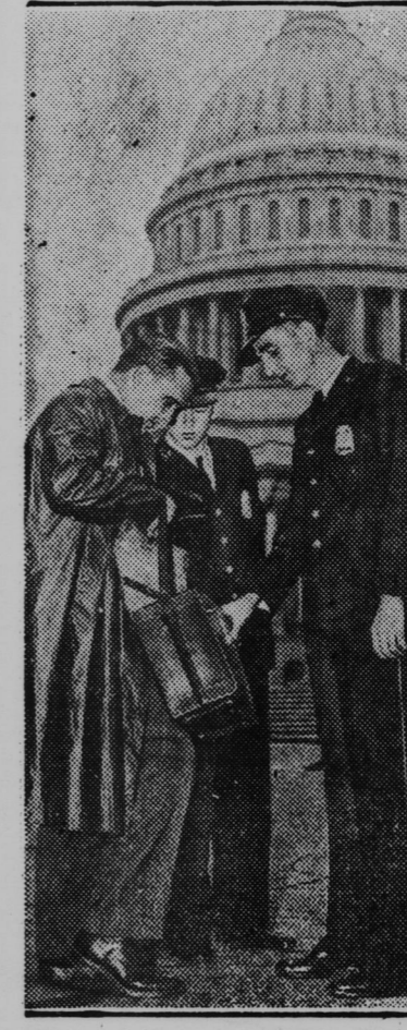
With every war come fanatics, so Washington's government buildings have been placed under strict guard and sightseers restricted. Above, a capitol guard searches a news photographer's camera case.