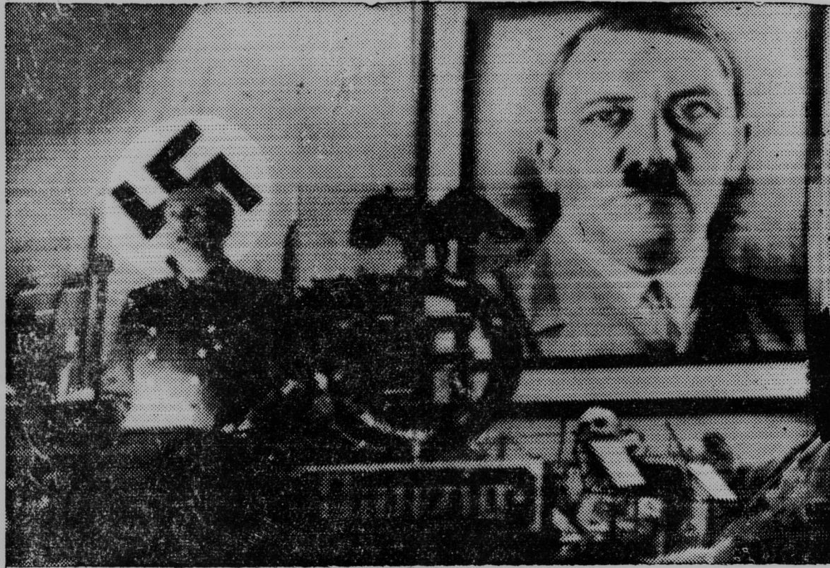
German Foreign Minister Joachim von Ribbentrop, speaking at Danzig on the anniversary of the founding of the Nazi party nine years ago, declares that the guilt for the present European war rests with Great Britain. The foreign minister, who rarely makes a public address, declared Germany is prepared to fight Britain to the finish, and made a vituperative attack on Prime Minister Chamberlain of England. Photo flashed by radio from Berlin to New York.