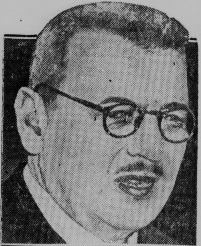
Shown in his latest photo, Dr. Juho Paasikivi, leader of the Finnish delegation to Moscow...