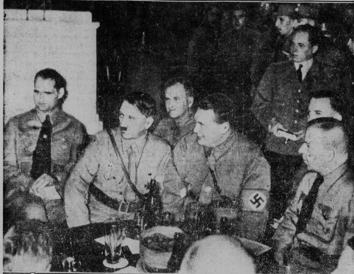
Adolf Hitler and his aides in the Buergerbrau Beer Cellar, Munich, at the 1937 annual celebration of the "Beer Cellar Putsch of 1923." The Fuehrer escaped by fifteen minutes a time-bomb explosion intended to snuff out his life when forced to leave this year's celebration, hurried for time by affairs of state.