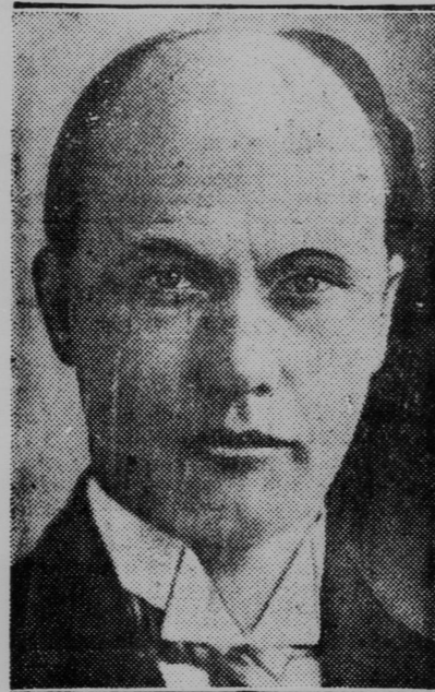
Richard J. Sandler Reports from Stockholm indicated Richard J. Sandler might be removed from his post as Sweden's foreign minister as a result of inspired German newspaper attacks. It was believed the Nazis, under Russian pressure, were trying to frighten Sweden into halting flow of supplies into Finland.