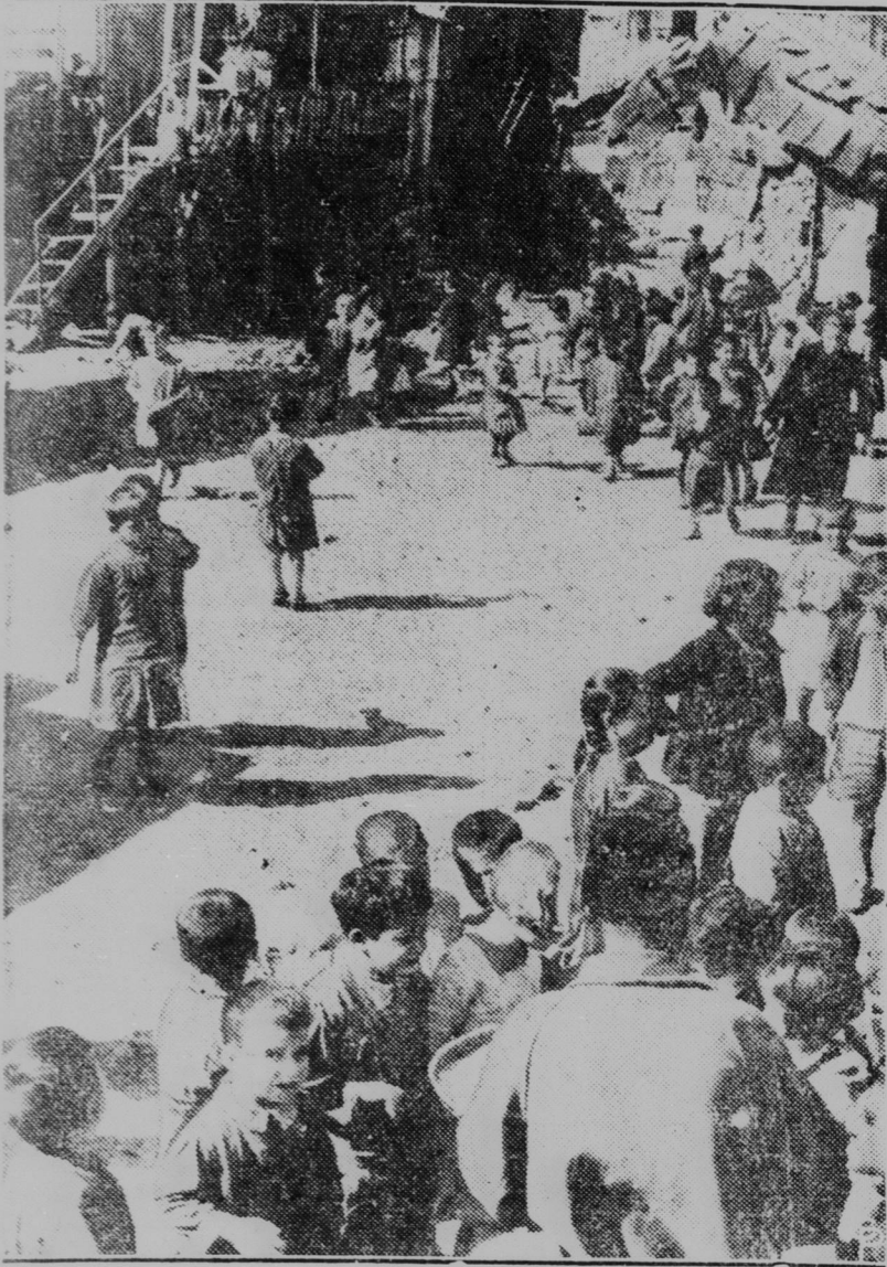
Here is a street scene in the Turkish city of Ordu, on the Black Sea, with children lining up at a relief station after the last earthquake there.

Late Estimate Put Dead at 40,000 in One Province; Air-planes Drop Food And Clothing to Sufferers in Sub-Zero Weather.