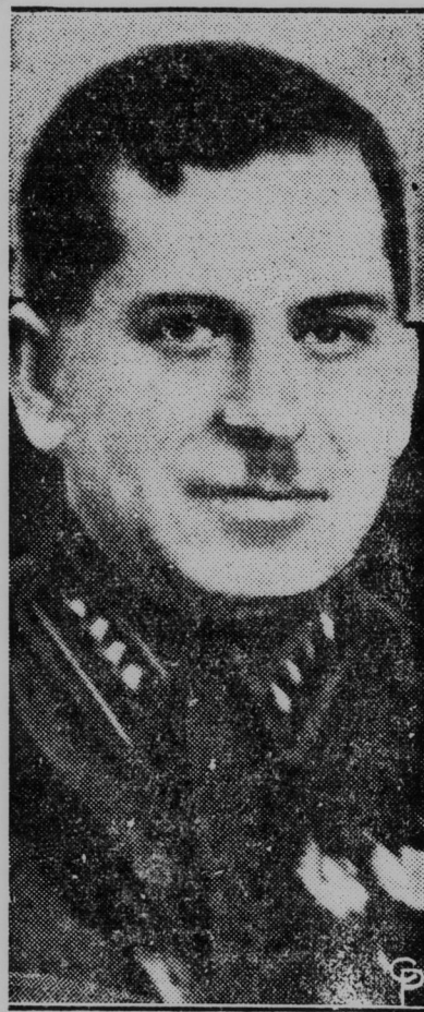
Gen. G. M. Stern

Hero of Russia's 1938 Far Eastern "vest pocket war" with Japan, Gen. G. M. Stern has been placed in charge of the Soviet forces slated in their attempted conquest of Finland.