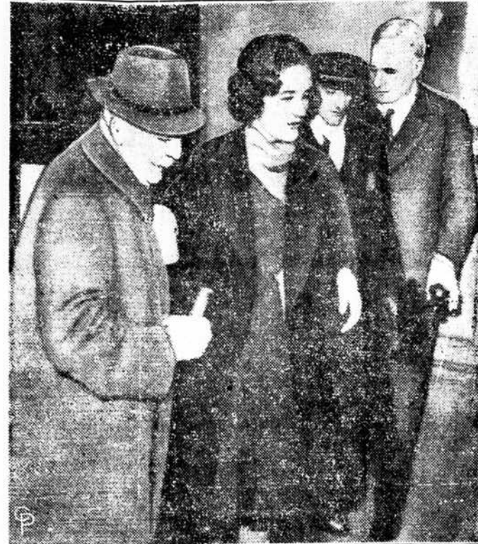
Miss Unity Valkyrie Freeman-Mitford, blonde friend of Adolf Hitler, is helped from ambulance in Folkestone, England, by her father, Lord Redesdale (left) and a chauffeur. She reportedly shot herself after an argument with Hitler. Note bandage around her throat. Photo flashed by radio from London to New York.