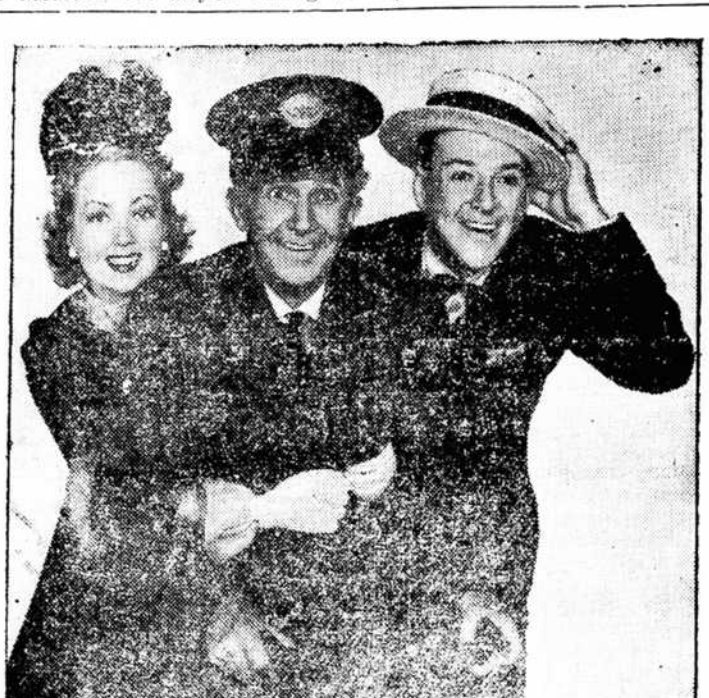
Sothern and William Gargan in "Joe and Closing Grain in The President"—Stavenson Sunday Only. What are an astronomer's commer-dial forecasts worth? If a physician inderstands germs, does that qualify Ethel Turp Call On The President —Stavenson Sunday Only.