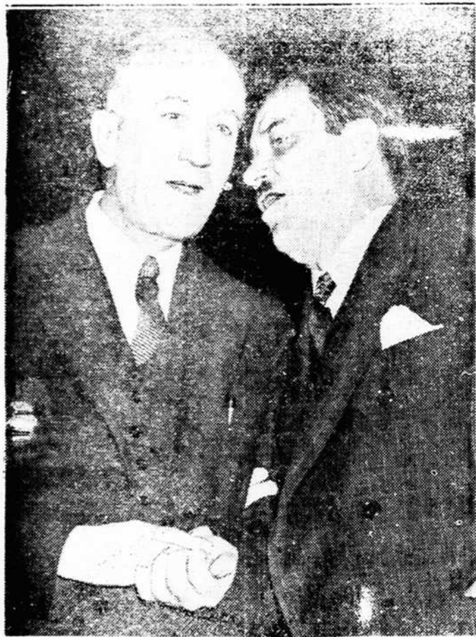
William Z. Foster (left), chairman of the Communist party, and Earl Browder, secretary, exchange a few confidential words during a Red rally in New York's Madison Square Garden. Browder, out on bail pending appeal on his four-year prison sentence for passport fraud, was principal speaker.