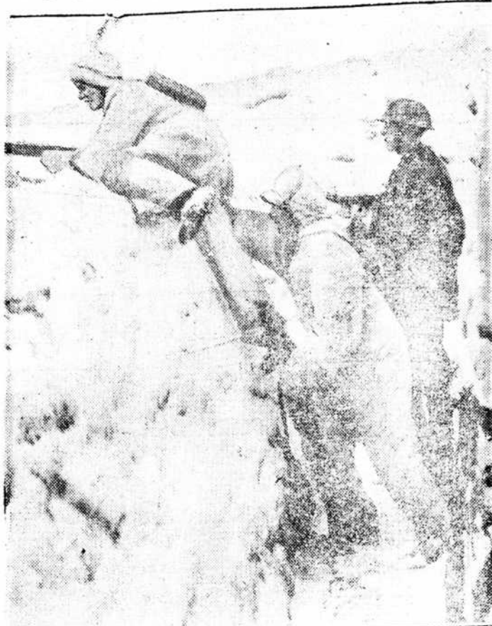
Contrary to general belief, the Finnish stunt of using white coveralls over uniforms as camouflage is not new, and here's proof. This photo, made 25 years ago, shows British snipers, dressed to blend with the snow, going over the top in the World War's Artois sector.