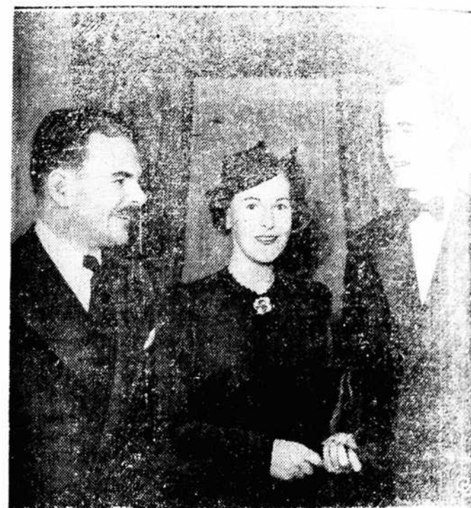
Making a whirlwind campaign tour through New England, Thomas E. Dewey (left) is welcomed to Rhode Island, at a banquet in his honor at Providence, given by Governor William H. Vanderbilt (right). Mrs. Dewey stands between the two men. The New York District Attorney is a G.O.P. candidate for the presidential nomination.