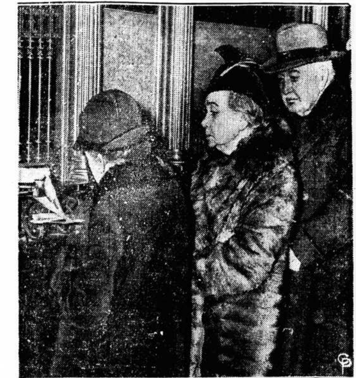
Aging men and women line up at bank window in New York to cash their old age insurance checks. Each is over sixty-five, each received the Government bounty for first time. Average payment is $26.