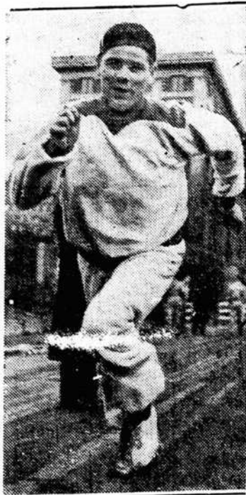
Speeding straight for the camera is Taisto Maki, Finnish distance runner, getting in trim at Columbia University in New York. Maki, in U. S. with Paavo Nurmi, Flying Finn of another generation, will tour the country for the benefit of the Finnish Relief Fund.