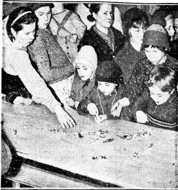
Candy makes a big hit with Finnish child refugees sheltered temporarily at a school in Luonenjoki, out of reach of the Russian war machine. The children are waiting no time going after the sweets being distributed by the Finnish Relief Commission, which is headed by former U. S. President Herbert Hoover.