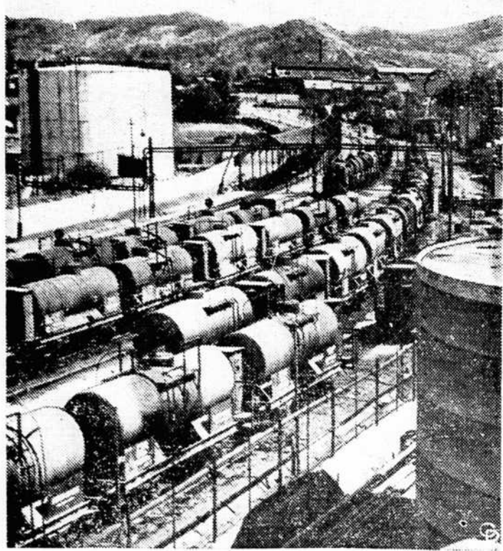
Here is a view of one of Rumania's oil refineries, which have placed the country in a dispute between Germany and the Allies over who shall get the petroleum. The oil is piped down from wells in the hills to the large tanks, refined, and pumped into tank cars on the siding.