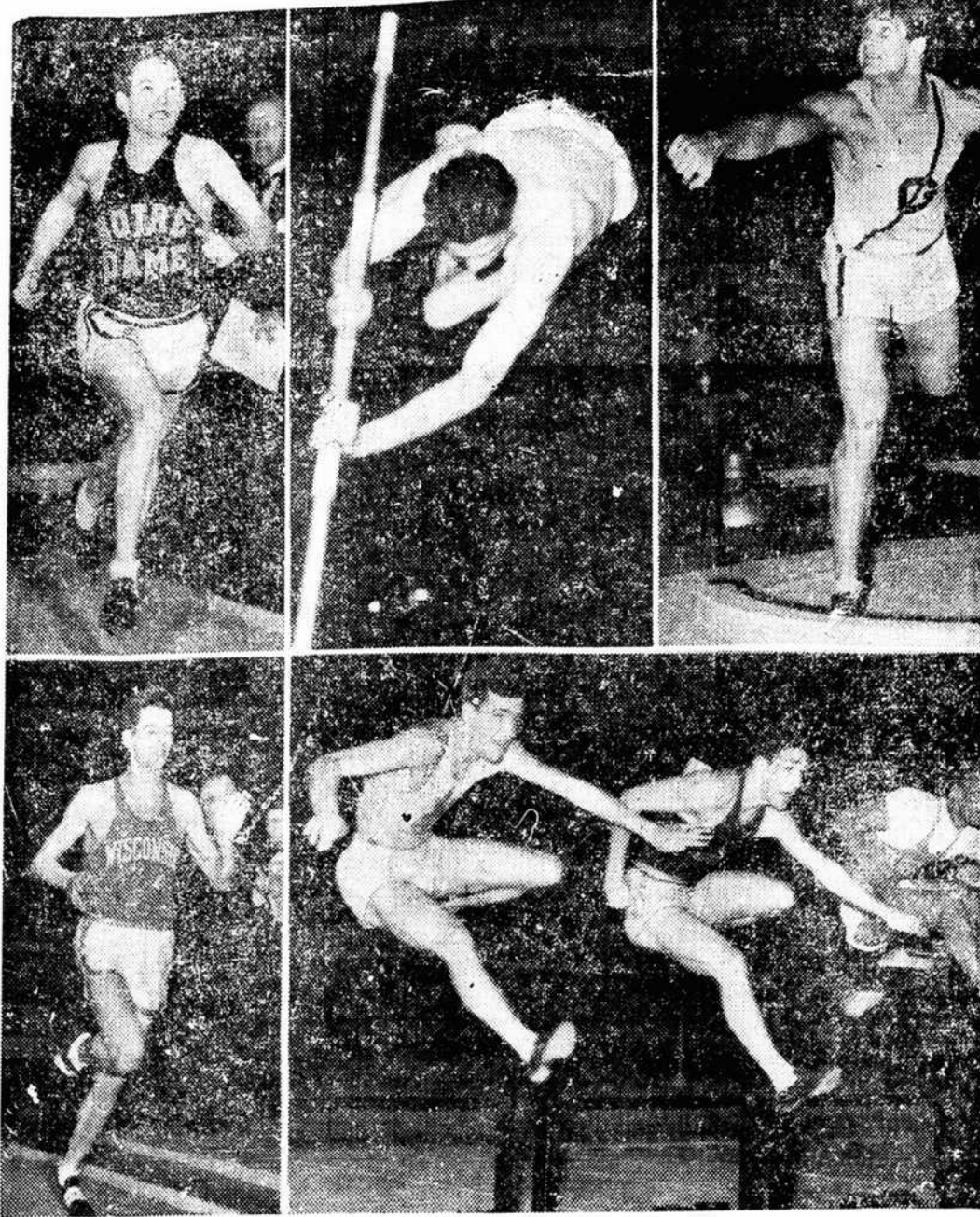
Here are five of the champions in action at the National Indoor A. A. U. meet in New York. Top left, Gregory Rice breaks the world three-mile record with a 13:55:9 race. Top center, Earle Meadows, Los Angeles, soars 14 feet 3 3/4 inches, a meet record. Top right, Al Blozis, Georgetown, hurls the 16-pound shot 55 feet 8 3/4 inches, a world's record. Lower left, Chuck Fenske wins the mile run in 4:08:8, a meet record. Lower right, Allan Tolmich (center), Detroit, runs the 70-yard high hurdles in 0:08:4, a world record.