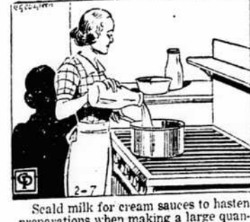
Scald milk for cream sauces to hasten preparations when making a large quantity of cream sauce or if in a hurry.