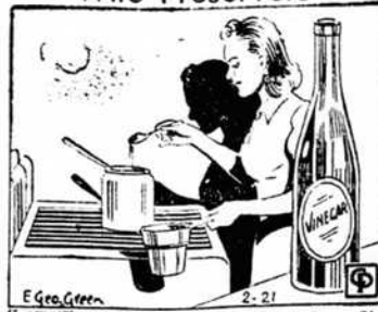
The lower part of the double boiler will not become lime-coated if a teaspoon of vinegar is added to the water before putting on the top part of the boiler.