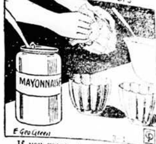
If you grease your salad with mayonnaise before you add the dressings in they will keep better and the mayonnaise will give your salad an extra nice flavor.

The man at the next desk says he hopes we don't have many more