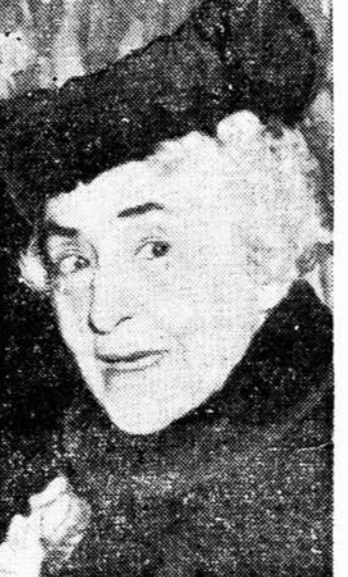
Anne Morgan Enroute to Europe to engage in war relief work as president of the American Friends of France, Miss Anne Morgan is shown aboard the Conte di Savoia. She is a sister of J. P. Morgan, the noted financier.