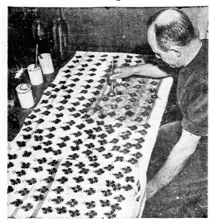
Anticipating a big crop of heroes when the war on the Western Front starts in earnest, the French government is preparing the laurels in advance. This man is varnishing some of the 500 Croix de Guerre medals and an equal number of the Medaille Militaire turned out daily at the Paris mint. (Central Press)