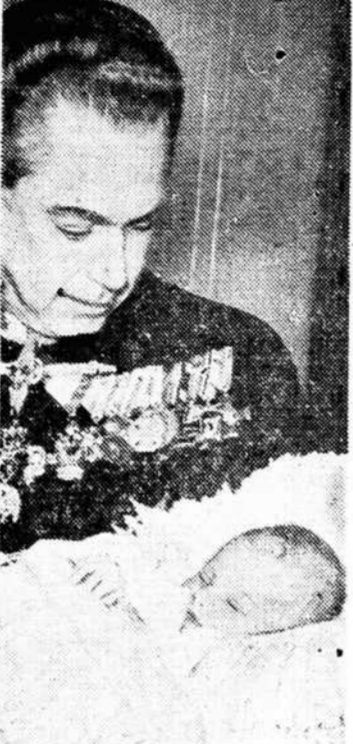
Archduke Albrecht of Hungary holds his daughter, Princess Katharine, after she had been christened at Budapest recently. Special permission was obtained from Regent Horthy to christen the child a Princess of Hungary.