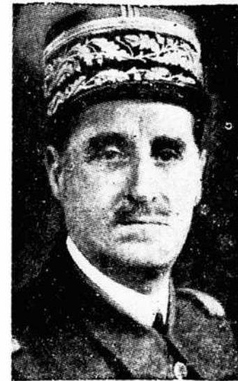
To General Blanchard (above) commander of the French forces in Dunkerque, fell the unenviable task of trying to save the important Channel port for the Allies after capitulation of King Leopold to the Germans. Dunkerque was last large Channel port left open to the hemmed-in Allied army surrounded by the Nazi "pocket."