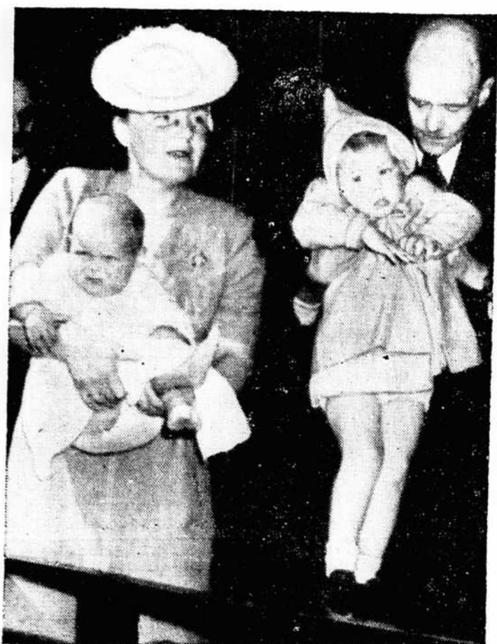
Boarding Train at Halifax

Shown on the rear platform of the train which bore them from Halifax, Nova Scotia, to Ottawa are Princess Juliana of the Netherlands, holding her nine-month-old daughter, Princess Irene. At right one of the members of the party holds Juliana's eldest, Beatrix, now two and a half years old. The Dutch Crown Princess and her children are guests of the Earl of Athlone at Ottawa for the duration of the war.